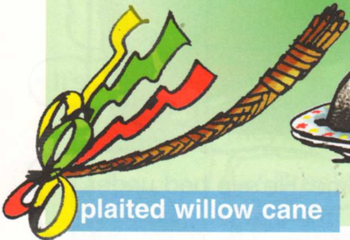
plaited willow cane