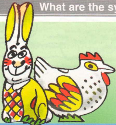
Easter bunny and Easter chick